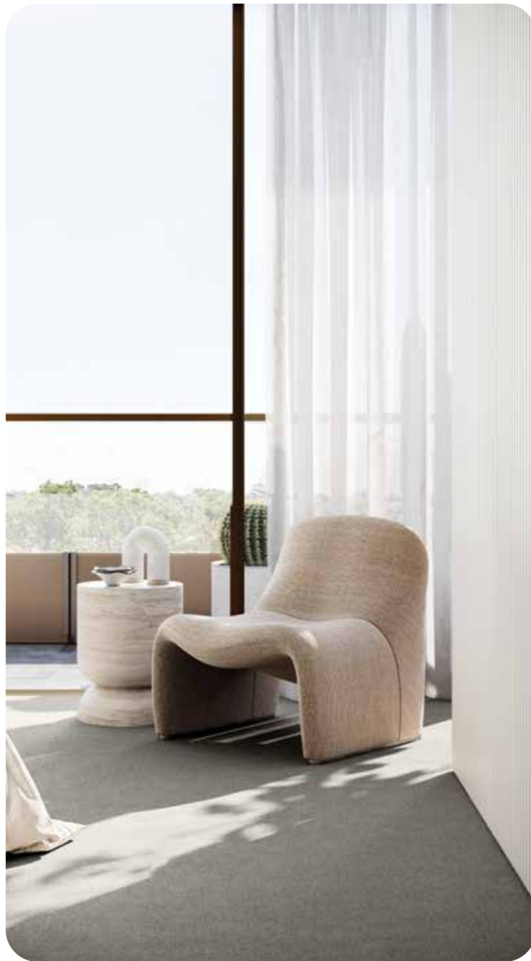
Artist's impression. Image shows upgraded finishes and fitting options. Furnishings included in this artist impression are not included in the apartment.

Sheer curtains to all windows in addition to blackout blinds to all windows (blackout blinds provided as standard).